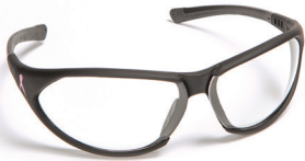
NBCF20E - CLEAR