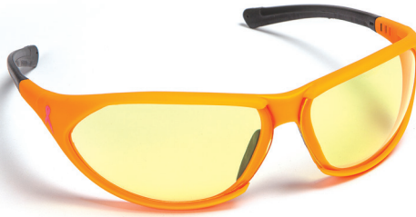
NBCF24E - AMBER