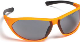
NBCF23E - SMOKE