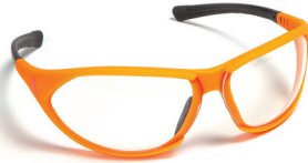
NBCF22E - CLEAR