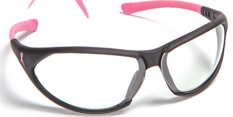
NBCF25E - CLEAR