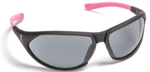
NBCF26E - SMOKE