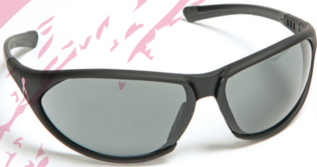
NBCF21E - SMOKE